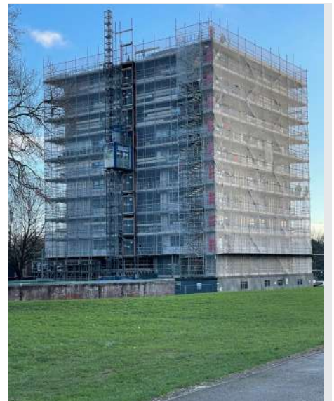
Work at Lydstep Flats Block 1, 2 and 3 Yn gweithio yn Fflatiau Lydstep Bloc 1, 2 a 3

Contractwr penodedig y Cyngor yw ISG Ltd a hyd y prosiect fydd tua 70 wythnos i gwblhau pob un o'r 3 bloc. Nod y prosiect yw gosod y cladid gradd A1 newydd, sydd o'r lefel uchaf o ddiogelwch tân. Daw ffenestri newydd, uwchraddir balconiau gan gynnwys balwstradau, drysau balconi Newydd ac bydd ailarynebu hefyd. Bydd pob eiddo hefyd yn elwa o system awyru echdynnu newydd ar gyfer y gegin, yr ystafell ymolchi a hefyd gosod fflw newydd ar y boiler.